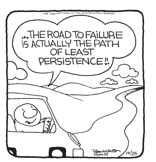
Ziggy

The goal of getting a college education may seem like a mountain that is difficult to climb. Break it into smaller steps that you can accomplish. See your college counselor or advisor, register for classes, attend the first class, read the first chapter, do the first assignment, and you will be on the road to your success. Then continue to break tasks into small, achievable steps and continue from one step to the next. And remember, persistence will get you almost anything eventually.