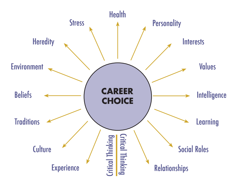
Figure 1.1 Factors in Career Choice.